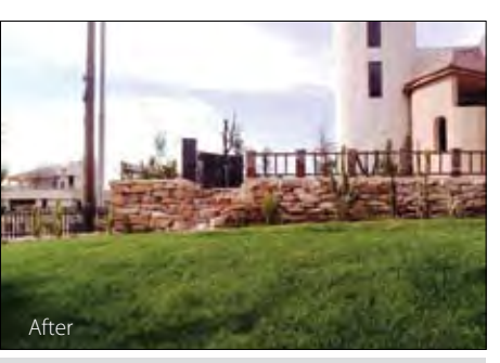
Fig. 3. Jordan lawn grass test in 2005 (1)